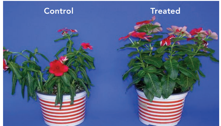
Vinca plants completion of Day 6