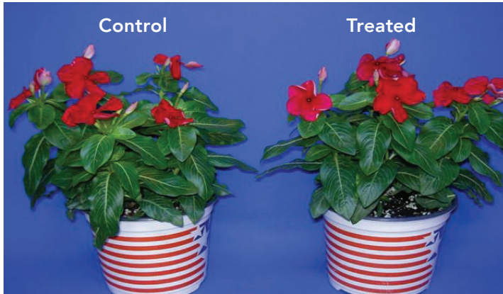
Vinca plants start of Day 1

A trial was conducted to determine the benefits of using Quantum Growth to improve water retention. The trial consisted of two vinca plants purchased from a local nursery. The plants were watered once at the beginning of the trial with the control vinca receiving 6 oz of water while the treated vinca received a solution of water and 2% Quantum. The trial was conducted in August in Jacksonville, FL. The plants were placed on an asphalt surface in direct sunlight for 6 days in a row. Neither plant received any additional water.