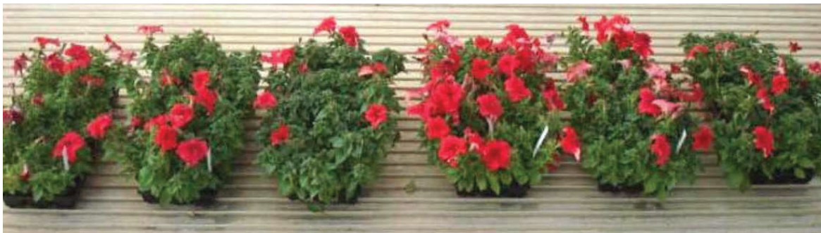
0 ppm 40 ppm 80 ppm Fertilizer Rate 0 ppm 40 ppm 80 ppm Control Quantum Growth

A trial was performed at a commercial greenhouse to compare various rates of additional fertilizer with and without Quantum Growth. As can be observed from the photo below, the best result came from 0 (zero) ppm additional fertilizer and Quantum Growth. We cite this result as a demonstration of the ability of the beneficial bacteria in Quantum Growth to sequester atmospheric nitrogen and make it available to the plant. Note how the excess nitrogen in both sets of flats leads to unregulated growth characterized by pronounced stem elongation and lack of blooms. Quantum Growth bacteria can provide supplemental nitrogen and facilitate plant nutrient uptake resulting in improved fertilizer efficiency and decreased fertilizer rates.