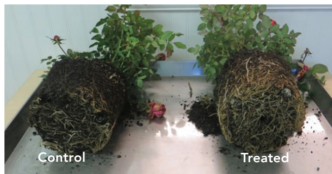
Root comparison at 7 weeks. Note the root color and volume, as well as flowering.