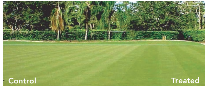
Note the darker green color with the Quantum Growth treated side of the turf.

"I wanted to let you know that what we found with the cores we pulled was astounding! Four weeks ago, I checked root depth and mass on the greens and could not find a healthy white root more than approximately 1 inch. Yesterday, virtually all of the cores exhibited phenomenal root mass with healthy roots exceeding 4 inches!"