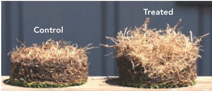
Notice the increase in root depth and density with the Quantum Growth plug.

Ensuring beautiful greens is priority number one for golf courses. Course superintendents are always trying to find smarter, cost effective ways to keep their grounds looking their best. A number of golf courses in Florida incorporated Quantum Growth into their best practices for maintaining their greens. The results were astounding, with increased root depth and density, faster grow-in rates, reduced irrigation amounts, and increased resistance to common turf diseases.