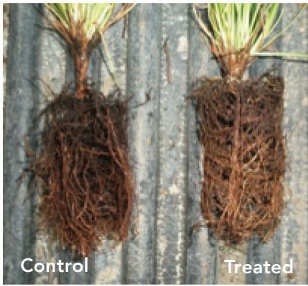
Fig. 3: The tree on the right has been treated with Quantum Growth. Root mass and root collar diameter of the inoculated trees are improved.