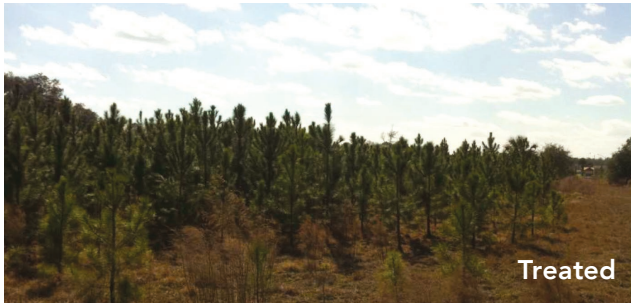
Fig. 5: These pictures show the same group of pines in 2012. As you can see none of the control group has survived. The treated pine trees received no additional inputs. Quantum microbes stay with the trees and grow in proportion with root exudates from the tree.

For more information visit GrowQuantum.com or call 866.871.0154.