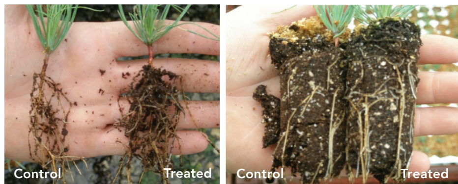
Fig 1: Seedlings treated with Quantum Growth are on the right in each picture. The visual evidence would indicate root mass increase on inoculated trees is greater than 25%.

For more information visit GrowQuantum.com or call 866.871.0154.