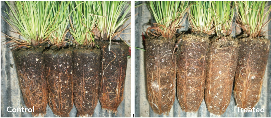
Fig. 2: Above are samples from the trees of both the control and the Quantum Growth treated plots. Notice the evenly spread root mass on the treated plugs, while the roots on the control plugs are located near the bottom.